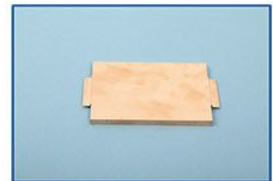
Weighted sealing flake